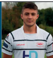
Lloyd South Lakes BMW