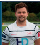
Horsfield Bldg. Serv's Engs.