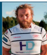
Ainscough Training Services