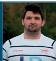
Nicky Donnelly Associates