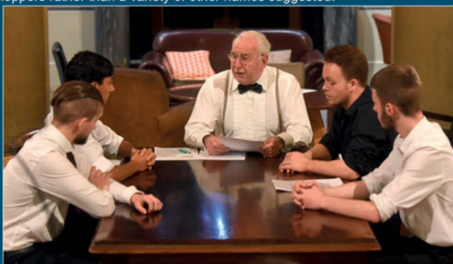
Photos above and right featuring the re-enactment of the meeting of the founders of Preston Grasshoppers and below an aerial view from the first floor.

The evening at the Harris concluded with the President presenting the actors with Sesquicentenary Hoppers caps and the distinguished guests with Sesquicentenary ties. Members then adjourned to various local hostleries including, appropriately, the Bull and Royal.