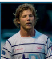
Tiernan A&D Systems Ltd