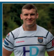
Fun at Work