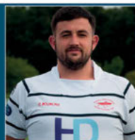
Noblett's Fish & Chips