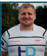
Haleys Business Advisors