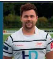
Horsfield Bldg. Serv's Engs.