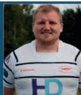
Haleys Business Advisors