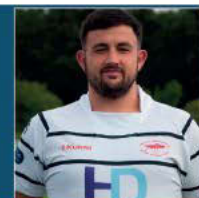
Noblett's Fish & Chips