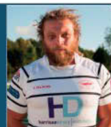
Ainscough Training Services