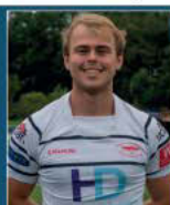
Bailey Financial Services