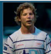
Tiernan A&D Systems Ltd