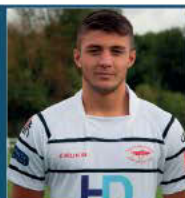
Lloyds South Lakes BMW