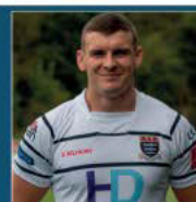
Fun at Work