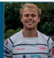
Bailey Financial Services