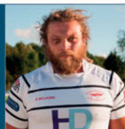
Ainscough Training Services