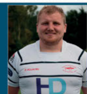
Haleys Business Advisors