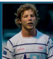
Tiernan A&D Systems Ltd