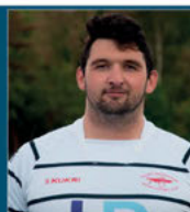
Nicky Donnelly Associates