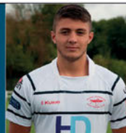
Lloyd South Lakes BMW