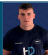
Fun at Work