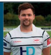
Horsfield Building Services Engineers