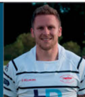
S Jones Hearing